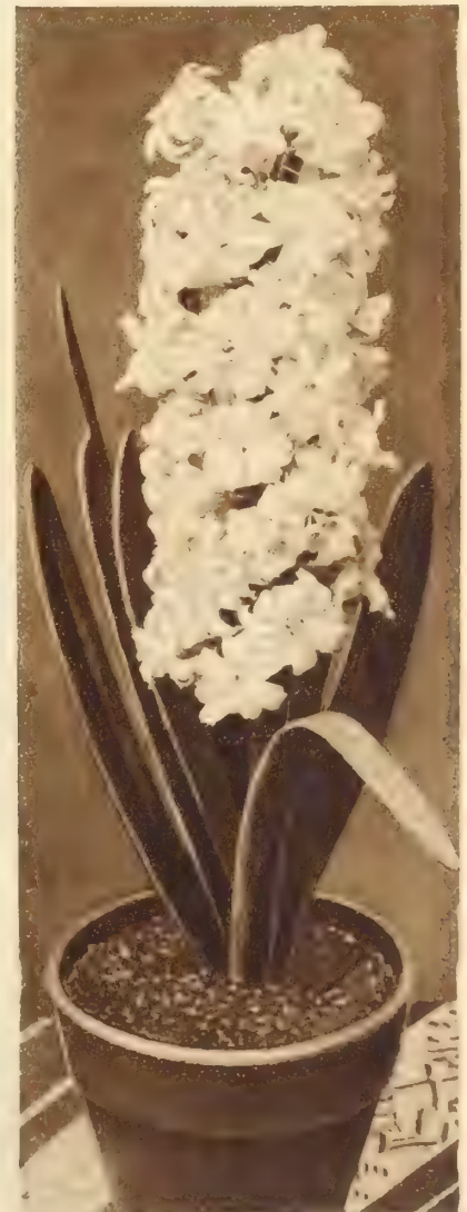
DOUBLE HYACINTH IN POT